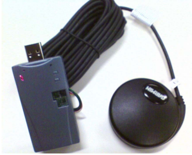
Figure 1. The device carried by the hiker