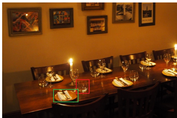
Figure 1: LOCATEDNEAR facts assist the detection of vague objects: if a set of knife, fork and plate is on the table, one may believe there is a glass beside based on the commonsense, even though these objects are hardly visible due to low light.

plex image scenes (Yatskar et al., 2016). See Figure 1 for an example.