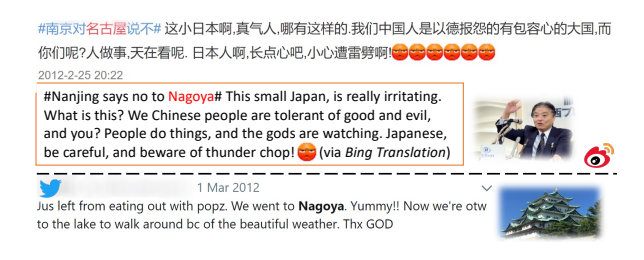
Figure 1: Two social media messages about Nagoya from different cultures in 2012

Computing similarities between terms is one of the most fundamental computational tasks in natural language understanding. Much work has been done in this area, most notably using the distributional properties drawn from large monolingual textual corpora to train vector representations of words or other linguistic units (Pennington et al., 2014; Le and Mikolov, 2014). However, computing cross-cultural similarities of terms between different cultures is still an open research question, which is important in cross-lingual natural language understanding. In this paper, we address cross-cultural research questions such as these: