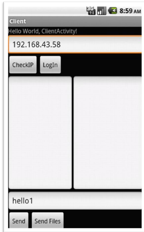
Figure 2 interface of client

We can see that as long as one client(student) logged in, the server will receive a message indicating the identification of the client(student), then the server automatically searches the matched data in the database and changes the correspondent student's name from "absent" to "attended".