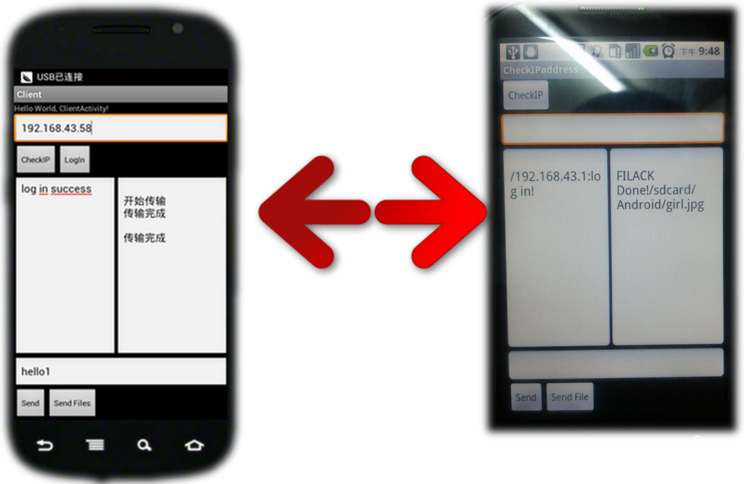
Figure 5 procedures of uploading

We can see that the client(student) choose the right path of the homework in his/her cell phone, then send it to the server(professor), the cell phone of the server(professor) will ask him to choose a path to save this file(homework).