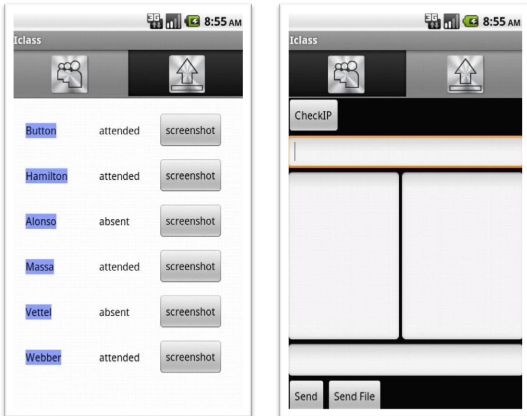
Figure 1 Interfaces of server

The following pictures are the interfaces of server and client: